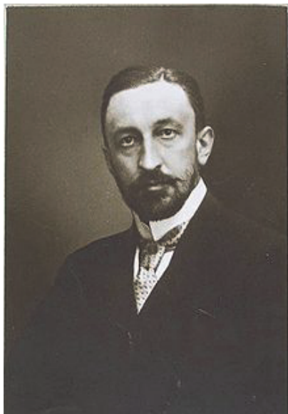
Fig. 6 – Jozéf Brudziński (1874–1917).

Jozéf Brudziński (1874–1917) (Figure 6) was a Polish doctor, a pediatrician. After World War I, he renewed the Polish University in Warsaw, and was appointed as a director of the same. In that time, Brudziński released four manu-