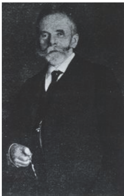
Fig. 3 – Heinrich Irenaeus Quincke (1842–1922).

physician Heinrich Irenaeus Quincke (1842–1922) who presented his experience at the Conference of Internal Medicine in Wiesbaden, Germany. In the United States, the procedure was implemented in 1891 by Arthur H. Wentworth in the children's hospital 12 . Winter's technique was involved in making incisions in 2nd lumbar region, such as major cut and placing a tube with a rubber drainage and so knocked infected content and reduced the pressure 13 (Figure 4). Also, he measured the level of sugar and protein in the cerebrospinal fluid, describing low sugar in purulent meningitis. He found of the tuberculosis Mycobacterium tuberculosis in the CSF and thus diagnosed tuberculous meningitis 14 .