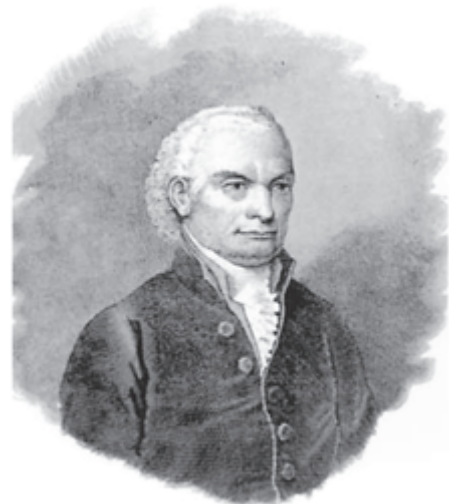
Fig. 2 – Domenico Cotugno (1736–1822).

Concept of cerebrospinal fluid (CSF) is closely linked to historical and medical development of meningitis. It is now known that the CSF is fluid that fills the subarachnoid space of the brain and spinal cord, and brain ventricles 1 . It is believed that Imhotep, an Egyptian doctor, and the notary, was the author of papyrus from 3000 BC, and the first one who discovered intracranial CSF. Name of cerebrospinal fluid was introduced by Francois Magendie (1783–1855), French physiologist, in the first half of the 19th century. Nicolo Massa (1485–1569), an Italian anatomist, in his book "Liber Introductorius Anatomiae" in 1536 was the first who described the CSF with cerebral chambers, based on autopsies. Previously, it was thought, by the beliefs of Hippocrates and Galen, that the brain ventricles contained "spirit of animals". It is generally accepted in medical history that the CSF was discovered by Domenico Felice Cotugno an Italian physician (1736–1822) (Figure 2). This famous doctor who lived in Naples in the 18th century published a paper, when he was 25, about the anatomical structures of the ear. He stated that not only were brain ventricle but the subarachnoid spaces filled by CSF, which was called "liquor cotunii" 8,9 .