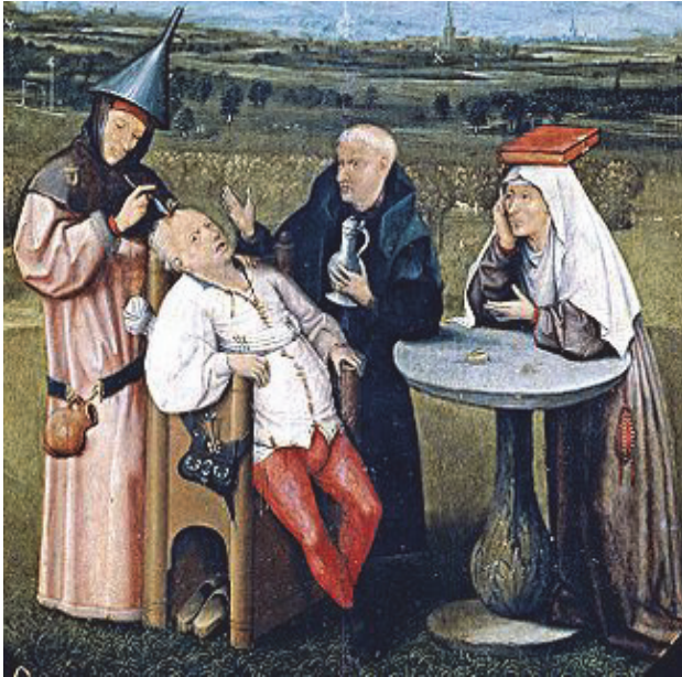
Fig. 1 – Trepanation – The Extraction of the Stone of Madness (a painting by Hieronymus Bosch).

the patient of evil thoughts and demons, the latter in some parts of our country, during the 19th century, the whole process had an element of vendetta. Particularly interesting is the fact that a high percentage of these patients, underwent surgery, and survived without the inflammatory process of the brain and meninges. A staggering figure when one considers that the intervention was performed by opening the skull, with unsterilized instruments, on which occasion would perpetrator watch brain membrane and thus establish "if it is dropped blood to the brain" (Figure 1) 5,6 .